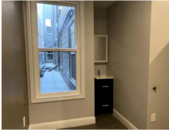
Typical Unit Interior