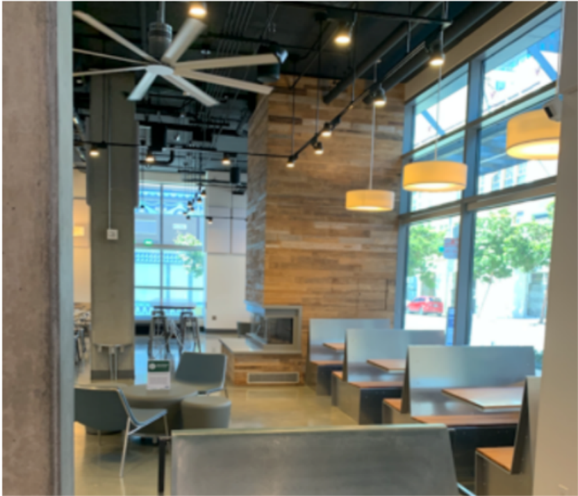
Pendant and track lighting at ground floor lounge