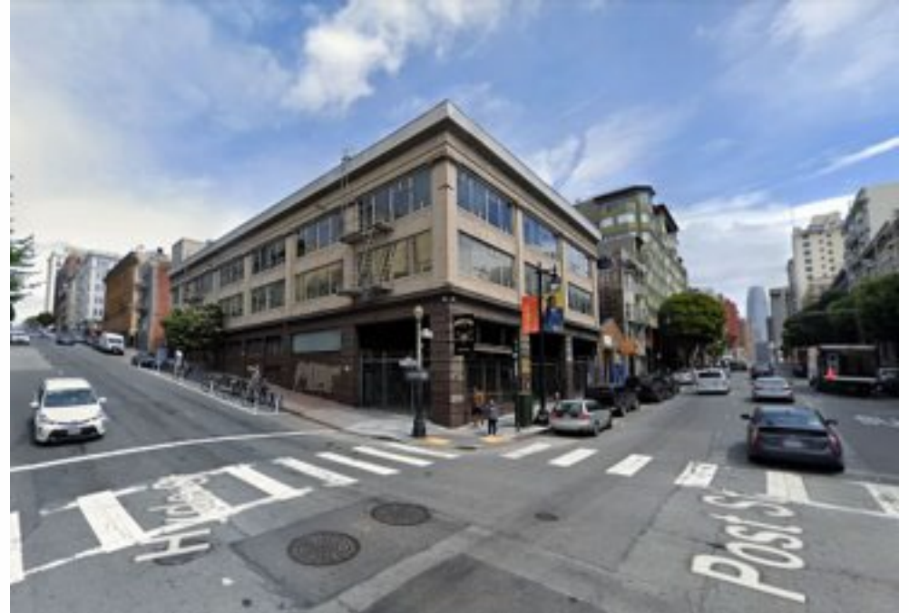
888 Post – TAY Navigation Center